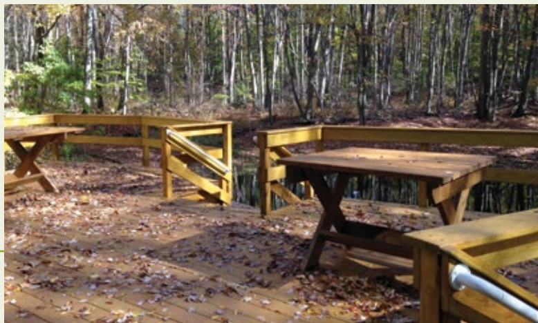
1 pond platform built for nature education programs

17 salamanders found and released in one day